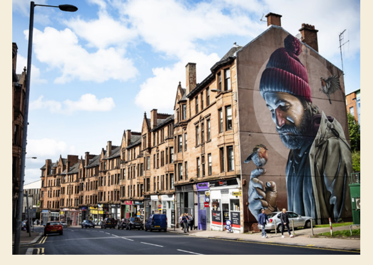
TOP: Many areas in Glasgow City feature stunning murals. BELOW: Dunluce castle, a ruined medieval castle in Northern Ireland and the renowned geographic wonder Giant's Causeway.